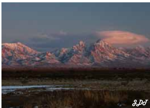
Christmas Eve Sunset