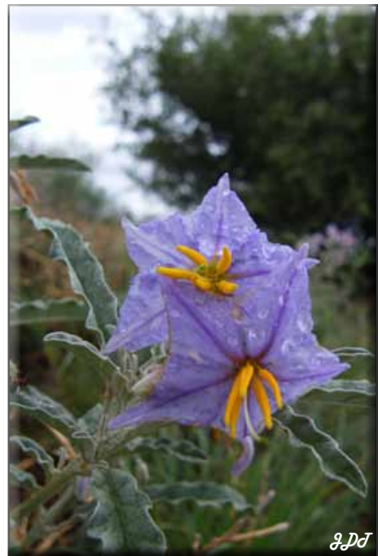
After the Rain