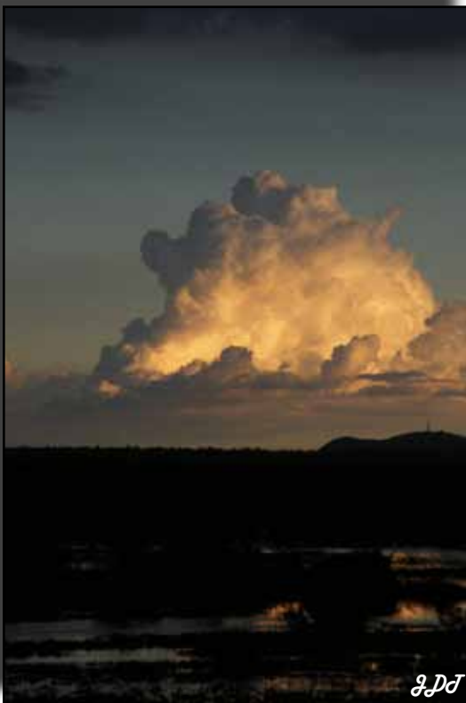
Lit from Within