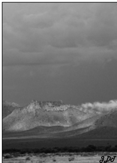
Sneekin' Over the Mountain